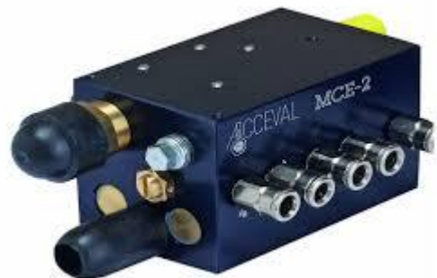
MCE-2 – LS2000

(Livré avec support métal, non représenté)